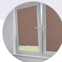
TILT & TURN WINDOWS